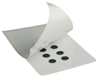
Sensor Spots self-adhesive, sterilized